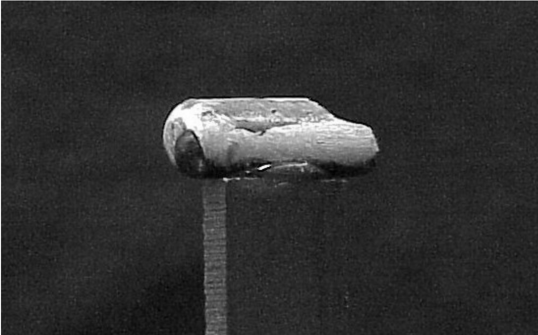
Figure 2. Residual rod-tip fragment recovered from noneroding test, with hemispherical nose intact.

rigid-body fashion, as the hemispherical nose appeared intact and completely undeformed (Figure 2). Radiography behind the target captured two residual rod segments on film: the first, 61.5 mm long, which included the rod tip, and the second, 18.5 mm in length. There may have been additional rod segments to follow, accounting for the remaining 21.9 mm or original rod length; unfortunately, the exposure times of the radiographs would have placed them just inside the target and hence, not viewable. Note that the recovered fragment of Figure 2 is the leading part of the 61.5 mm segment, which subsequently fractured upon impact with the wall of the testing facility.