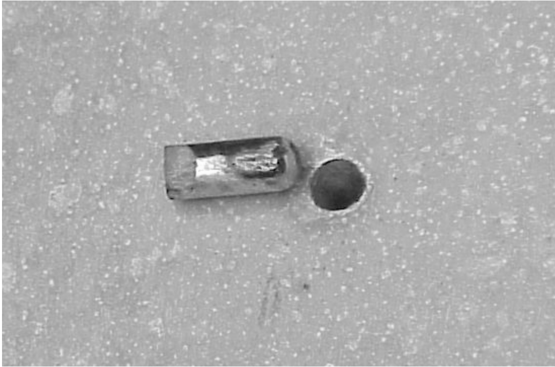
Figure 3. Crater cross-section of low-velocity test at a depth \sim 228 mm below the target surface (residual rod fragment shown for scale).

highly plausible that, not only the tip, but much of the rear of the rod was also laterally engaged with the target during the penetration event. Because of difficulty associated with edge detection of radiographic images, it was impossible to estimate, from the exiting residual rod fragment images, what length of the rod tip was bulged in diameter. And while the fracture and subsequent separation of the two radiographed rod segments is indicative of a tensile fracture 61.5 mm from the rod tip, association of this dimension with rod bulging would be conjectural, since both the rebound dynamics of the crater and the tensile reflections of the axial wave, off the rear of the projectile, might both influence this event.