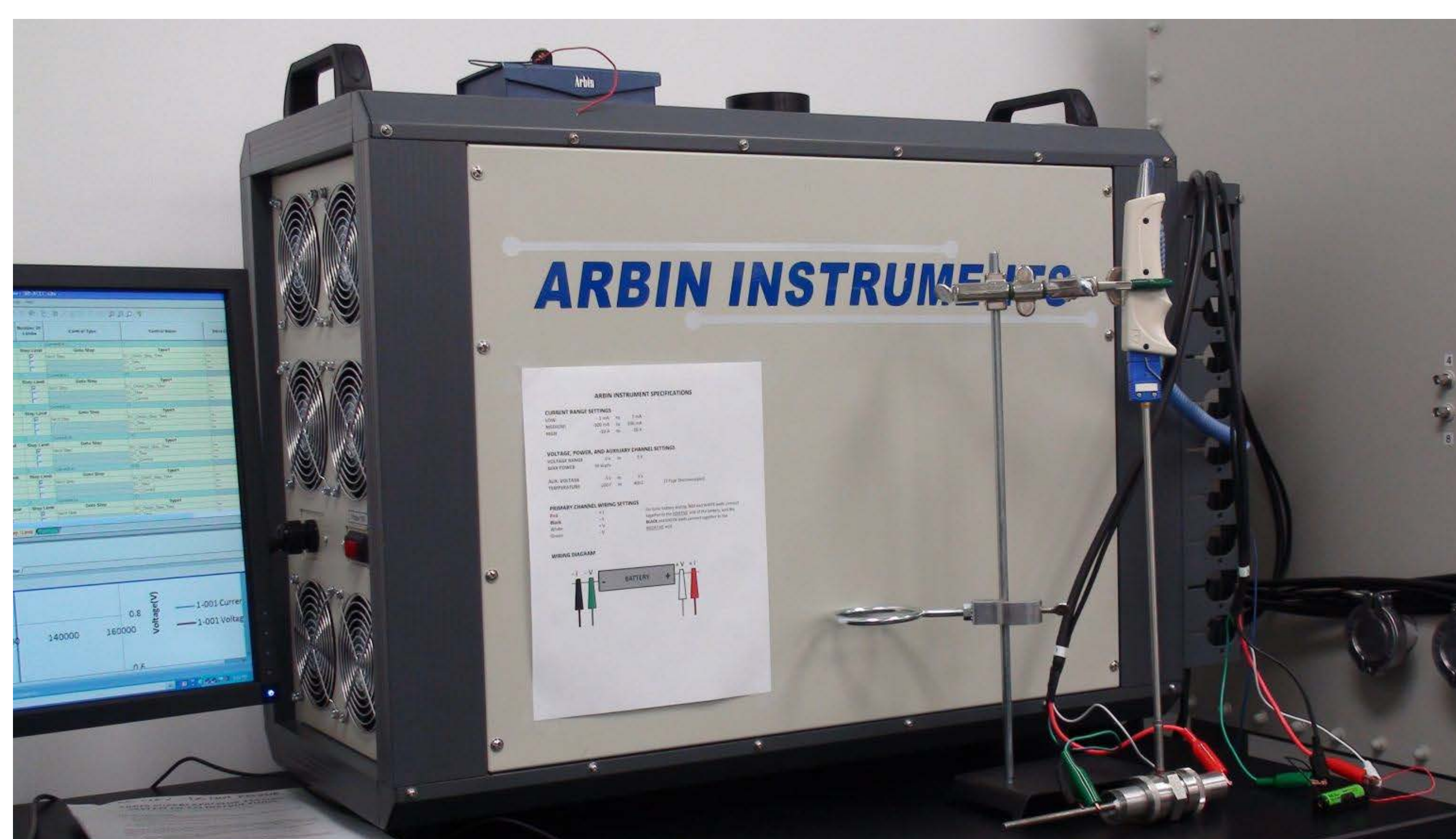
Arbin Battery Analyzer