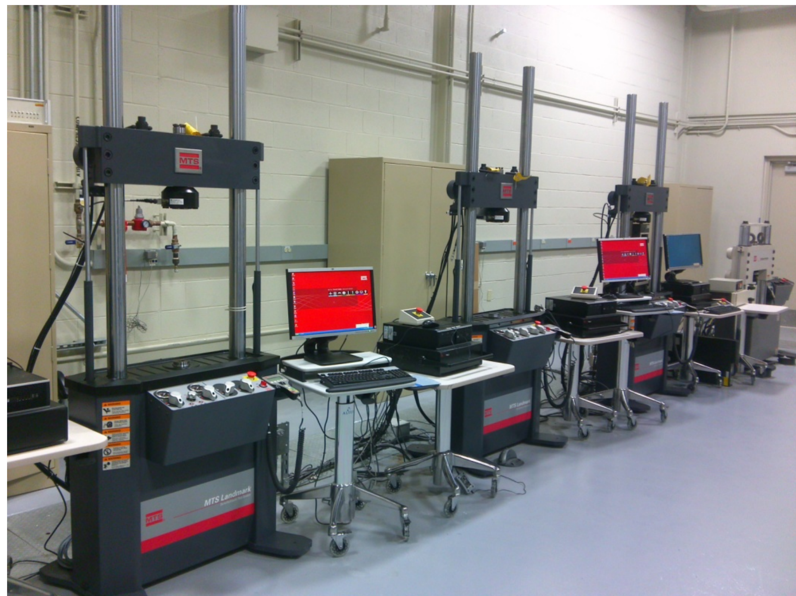
Axial Fatigue Mechanical Testing Systems