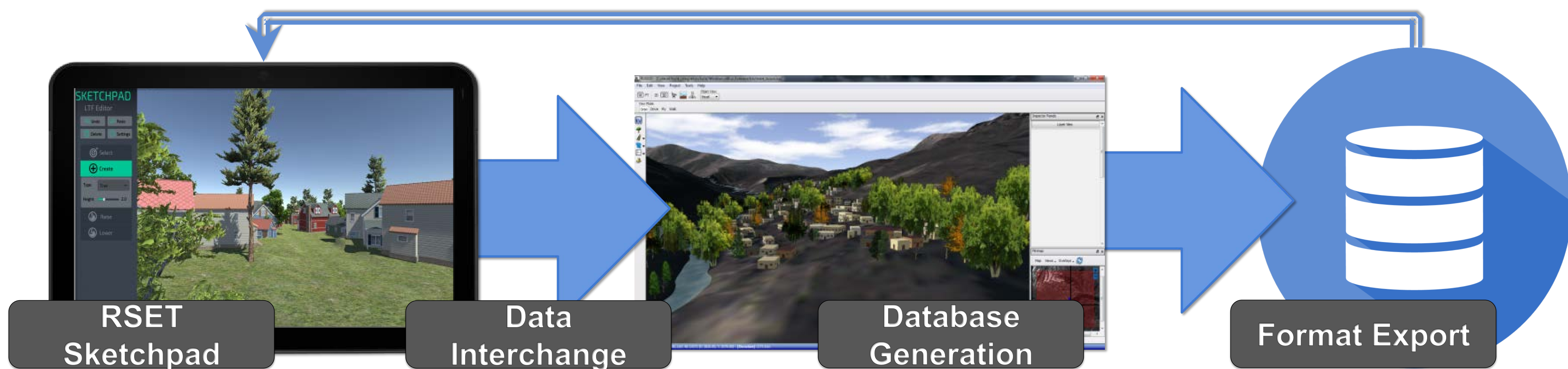
Illustration of the process pipeline. Data flows from Sketchpad editing (on left) through database generation tools into the runtime format. Updates to the runtime format are communicated back to Sketchpad.