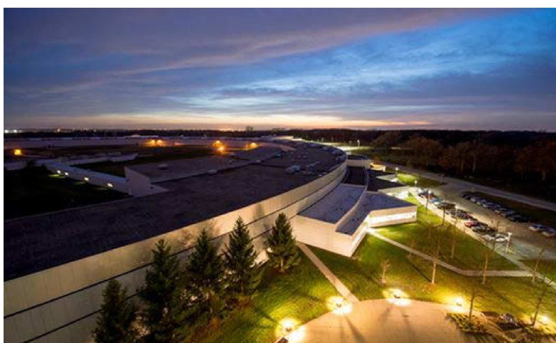
Dynamic Compression Sector (DCS) at the Advanced Photon Source